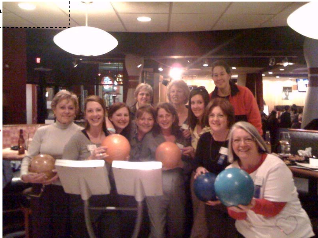
Our February meeting was held at Splitsville in Channelside on February 10th. As this picture reveals, fun was had by all that attended!