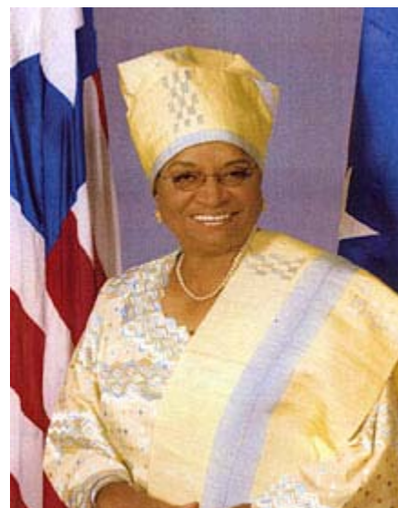
Liberian President Ellen Johnson Sirleaf

The UT commencement will be held at 10 a.m. on May 9 at the St. Pete Times Forum in Tampa. The event is free and open to the public, but seating is limited.